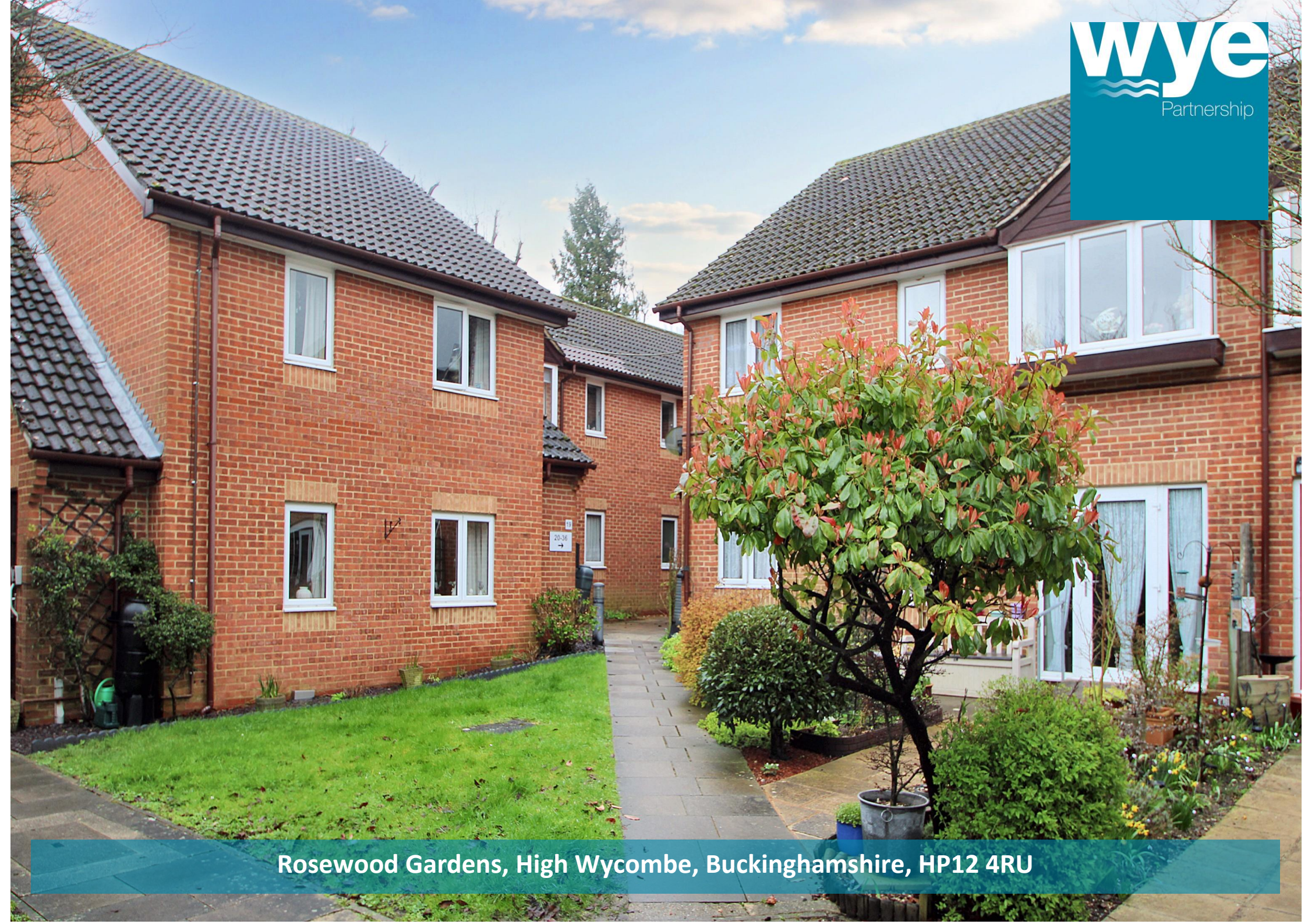
Rosewood Gardens, High Wycombe, Buckinghamshire, HP12 4RU